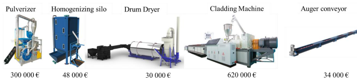
Fig. 2 Acquisition prices of the components of the technological line for the production of WPC

The main subject of research concerning economic intensity is a product based on the use of recycled wood-plastic raw material, namely WPC with large dimensions of 2,500 mm – 1,250 mm – 20 mm (height, width, thickness) and a weight of 48.5 kg. The investment plan identified a technological line for extruding WPC profiles (Fig. 2) as a suitable technological procedure, including the acquisition prices. The total acquisition level was quantified at €1,032,000 and the depreciation amount was determined to €172,000 by applying the linear method. The capital structure of the financing presented the ratio of 70% foreign capital and 30% EU structural funding. The technological line consisted of a pulverizer, homogenizing silo, drum dryer, cladding machine and an auger conveyor. Production capacity - the output of the extrusion line mixture is predicted at the level of 1,600 kg/h, which means that during an 8-hour shift, using 87.5% capacity, it would be possible to produce 11,200 kg of the mixture (annual capacity of 2,800 tonnes). This data can be used to model the structure of cost items using a type calculation formula.