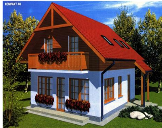
Fig. 1 Heating the house KOMPAKT 40 with an ATMO DC 18 boiler burning firewood.